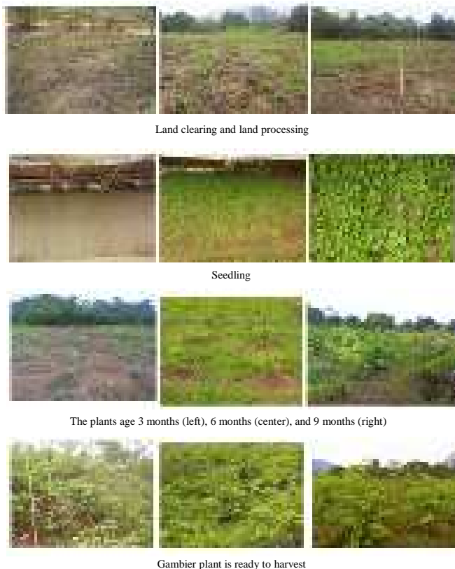
Fig. 1 Gambier plant cultivation activities grooves

cultivation. Gambier plant cultivation activities grooves can be seen in Figure 1.