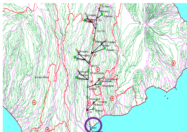
Fig. 2 The condition of the pattern of water in river estuary upstream to Petanu with RIBASIM

Based on the results obtained the flow velocity (V) average occurring in river estuary Petanu is 0.456 m / sec. The potential of water in River Basin until estuary Petanu based process using RIBASIM software input the data in the form of Hydrology (rainfall, evaporation), stream flow, water flow in river estuary of the results of measurements and maps Petanu watershed and the area irrigated. use of water to measure the amount of time half-month period, then the following scenario obtained through a process and the results of the water system in the river estuary upstream to Petanu according to the water system map (Picture 2) and specifically for water management in the river estuary given circled. Water resources management in river estuaries Petanu can be implemented by making dams / reservoirs are located ± 300 m from the shoreline Saba Gianyar regency.