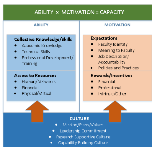
Fig. 1 Adaptation of the Birdsell, et al. box model (University of Memphis, 2013)

At the next stage, the drafts set of KPIs and measures were consulted with participants of Focus Group Discussion. Some of the comments included the needs to define the practical meaning of 'region' as it may be interpreted differently from the geographical point of the subnational area (e.g., province, district) vs. supranational area (e.g., South Asia, North America). Similarly, the terms 'institutional' and 'students' also need to be defined whether they are meant for the faculty level, department, or university level, and whether it is undergraduate, postgraduate, or research students. Based on the results of the FGD, the revised version of the KPIs and measures consisted of 148 measures, which are linked to 21 KPIs and are grouped into three themes as shown in TABLE . The assessment scales of each measure were also defined in the FGD.