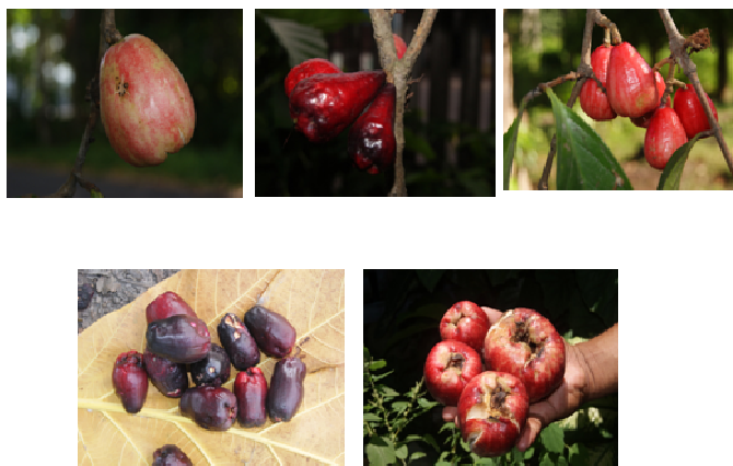
Fig. 1. Five local cultivars of malay apple was used in this research, above : Jati, Bottle, Bagea, below : Dark Purple and Red Circle (from left to right)

Identification of appropriate cutting propagation techniques would enhance the possibilities for developing and screening new hybrids with high food and market values. This may generate opportunities for introducing malay apple to rural farming systems and increasing farmers' incomes, like other popular fruit species and, by which improvement of exportation to international markets.