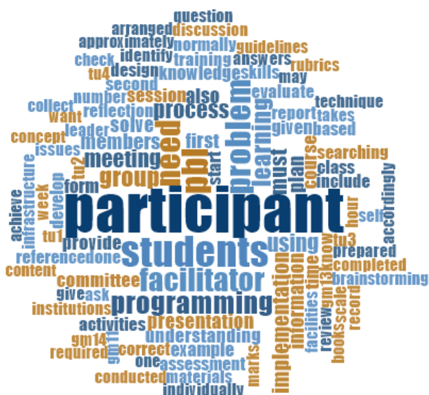
Fig. 2 PBL implementation word cloud analysis