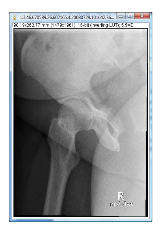
Fig. 4 Patient DICOM image (PPUKM, 2010)

Figure 4 and figure 5 show the output produced by the DICOM image information retrieval software. Each image contained of hundreds of information. This information is needed because it can help physicians in carrying out their research on the patient's X-Ray. As discussed in the previous section, the software will read four patient's information, PatientBirthName, PatientName, PixelSpacing and BirthDate . Some patient data were used to test the accuracy of the software to read DICOM patient information.