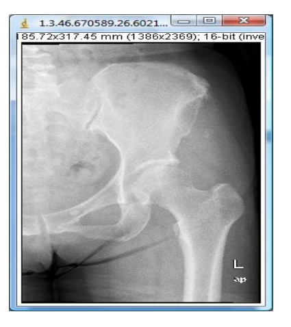
Fig.1 Dicom image

A DICOM data object consists of a number of attributes, including items such as name, ID, date, date of birth and also one special attribute containing the image pixel data. A single DICOM object can only contain one attribute containing pixel data. For many modalities, this corresponds to a single image. But note that the attribute may contain multiple "frames", allowing storage of cine loops or other multi-frame data. Another example is NM data, where an NM image by definition is a multi-dimensional multi-frame image. In these cases three- or four-dimensional data can be encapsulated in a single DICOM object. Pixel data can be compressed using a variety of standards, including JPEG, JPEG Lossless and JPEG 2000. Figure 1 below shows the example of DICOM image.