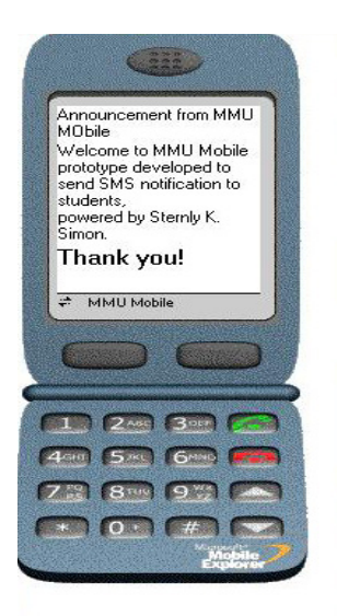
Fig. 7 Sample notification

Fig. 7 illustrates the notification received by the subscriber based on his subscription details. The Delivery Service implements SysMan TellMe V8.04 as the delivery protocol and SMS server.