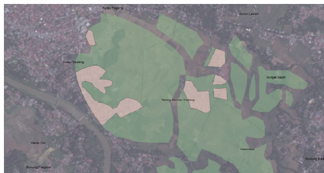
Fig. 1b Delineation of settlement area taken place within the agricultural land in Padang Municipality