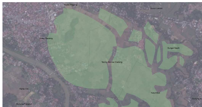
Fig. 1a Delineation of agricultural land according to spatial plan in Padang Municipality

Some factors as the reasons behind land conversion have been revealed among others are population, economics, social and culture, and lack of law enforcement [11]. Those factors happen to West Sumatra. Fig. 2 shows the cause and effect relation of why agricultural land conversion was escalated in study areas.